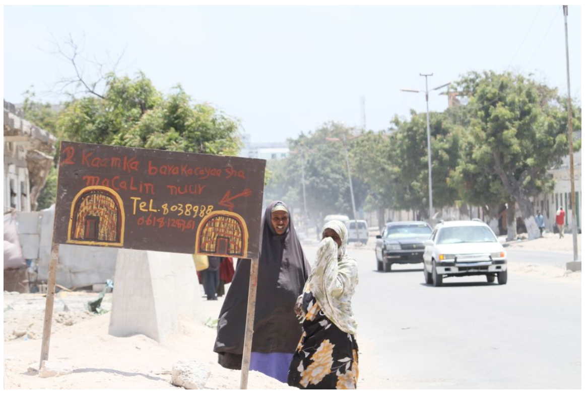
Displaced women stand next to a board advertising an IDP camp on Dabka Road in Hodan district, Mogadishu. Hosting the displaced is a lucrative business in Mogadishu—similar advertisements are scattered throughout the capital.

Tents delivered to IDPs in certain camps in Tarbuunka area were seen as the property of gatekeepers and their usage was stringently monitored by gatekeepers' militia. <sup>151</sup> According to numerous IDPs in these camps, the militia monitors the tents on a daily basis to make sure that the tents are clean because they are the property of the gatekeeper. The militias beat those who complain. <sup>152</sup> The militia linked to the gatekeeper also uses force and threats to prevent IDPs from removing the tents when they try to leave the camps. <sup>153</sup>