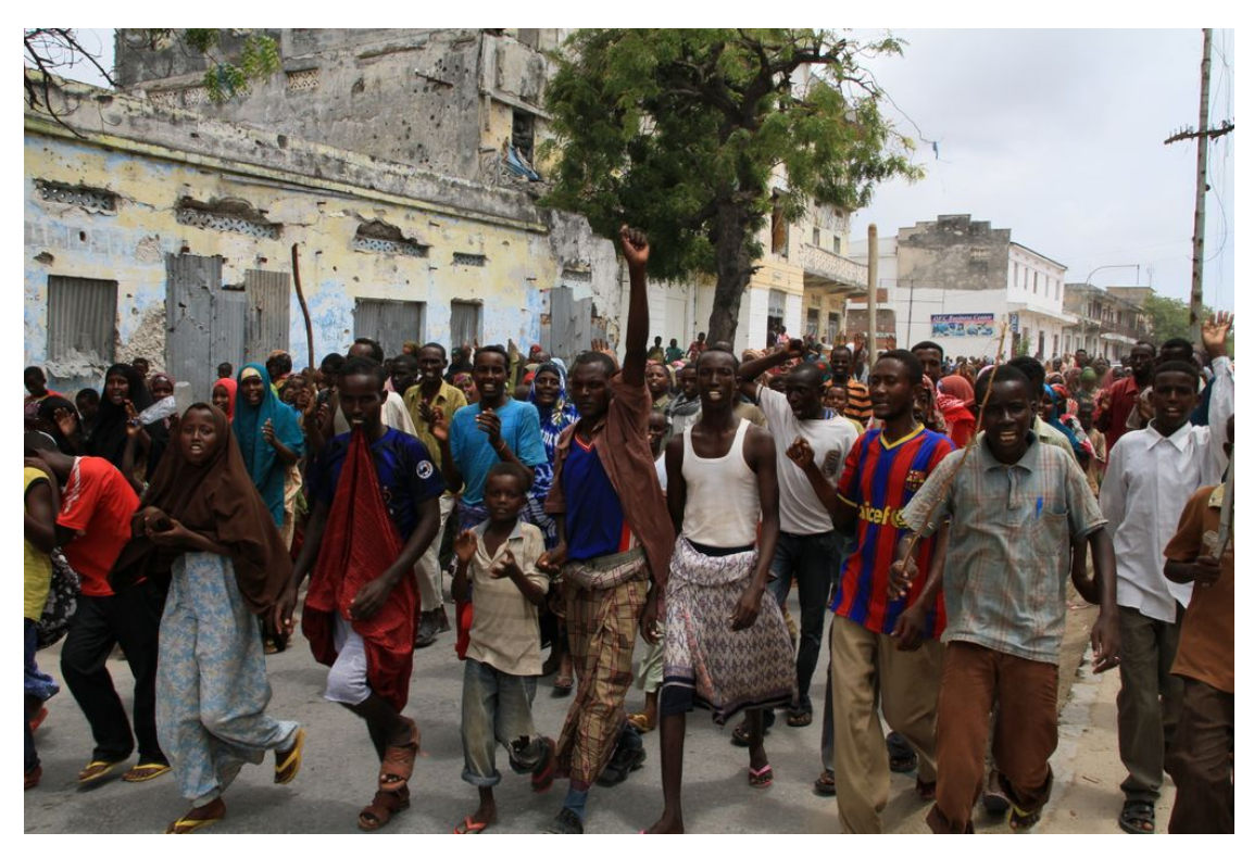
Large crowds of IDPs demonstrate in central Mogadishu against the diversion of food assistance. IDPs have held several demonstrations since the influx into Mogadishu in mid-2011. The government has not been responsive to their complaints, and in some instances has detained protesters.

Restrictions were also placed on external actors seeking direct access to the IDPs. Nongovernmental organizations described having to get the permission of gatekeepers in order to access the IDP camps. One UN staff member described with frustration how "everywhere you go, the gatekeeper will be there. We have tried to use distraction methods by splitting into groups so that the gatekeeper cannot follow us." 165