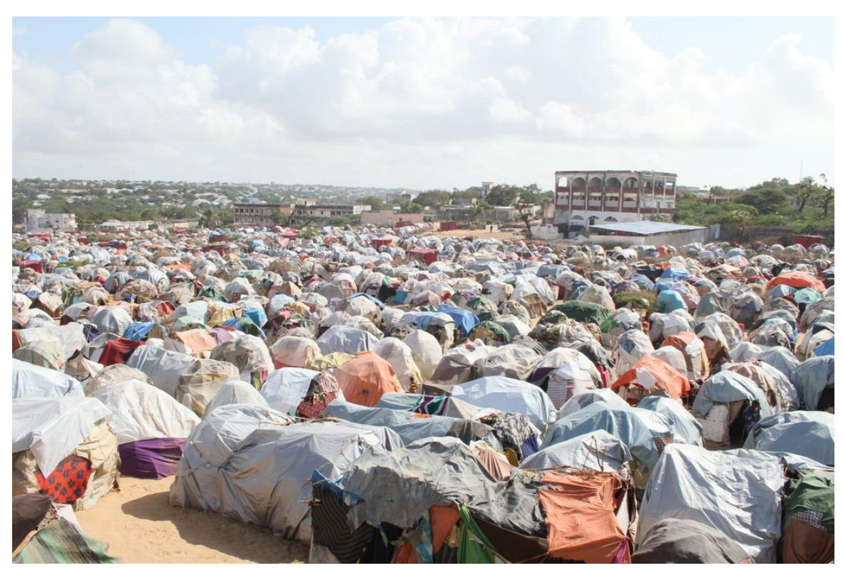
Sayidka (or Beerta Darwiishta) camp is the biggest IDP camp in Mogadishu's Wardhigley district. A week after this photo was taken in September 2011, government-affiliated militias fired into the air and forcibly looted food aid from the camp. Despite the camp's close proximity to the presidential palace, government forces did not intervene.

While more frequent in the initial phases of the 2011 influx, reports of looting continue.